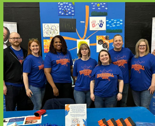
#KeeleyCares helped raise funds for Good Shepherd at their annual dodgeball tournament on March 1.

70% tax credits are available for donations over $1,000.