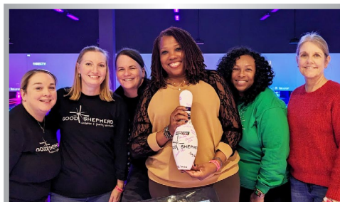
Members of Good Shepherd's Foster Care team

Good Shepherd's Foster Care program recently changed a family's life forever when they matched them with an eight-year-old boy at the end of 2023 through our Specialized Adoption service. Specialized Adoption helps families provide permanency to a child in the foster care system. This child has elevated needs, which are being met through the help of a collaboration between the pre-adoptive parents and our Treatment Foster Care (TFC) staff. Word is getting out about our innovative Specialized Adoption service as professionals from other agencies are reaching out to team up, and parents are recommending Good Shepherd's services to their friends. Good Shepherd currently has five Specialized Adoption placements and expects another four before the end of May. Every child deserves a loving family to call their own, and Good Shepherd is helping make that happen for children in foster care.